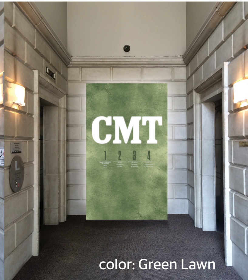
color: Green Lawn