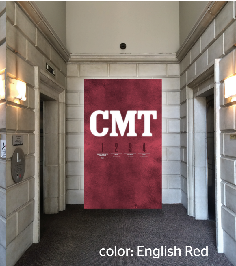
color: English Red