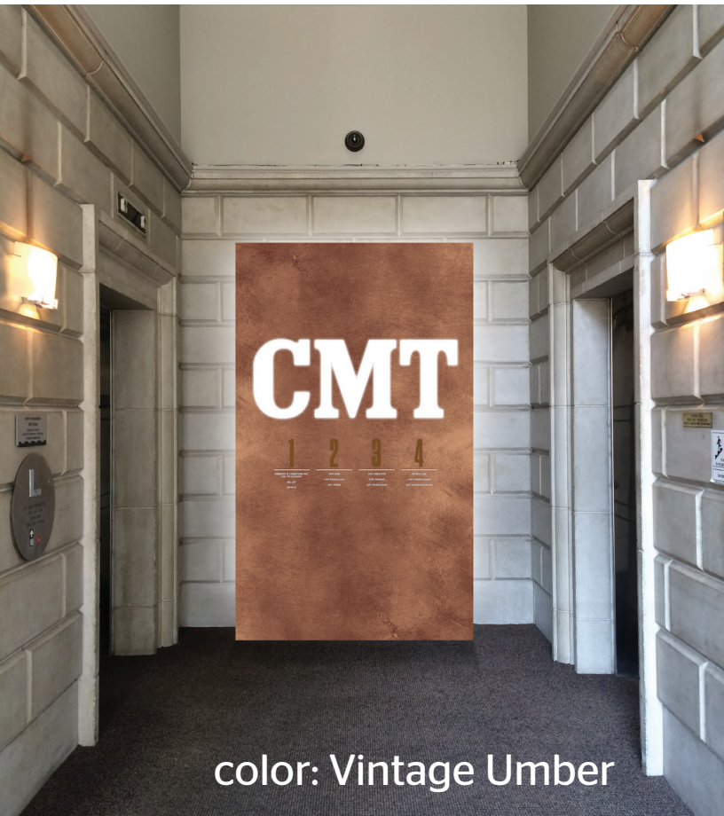
color: Vintage Umber