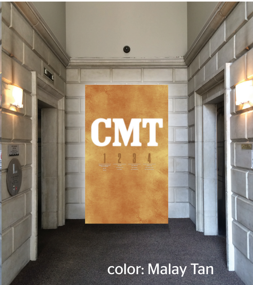
color: Malay Tan