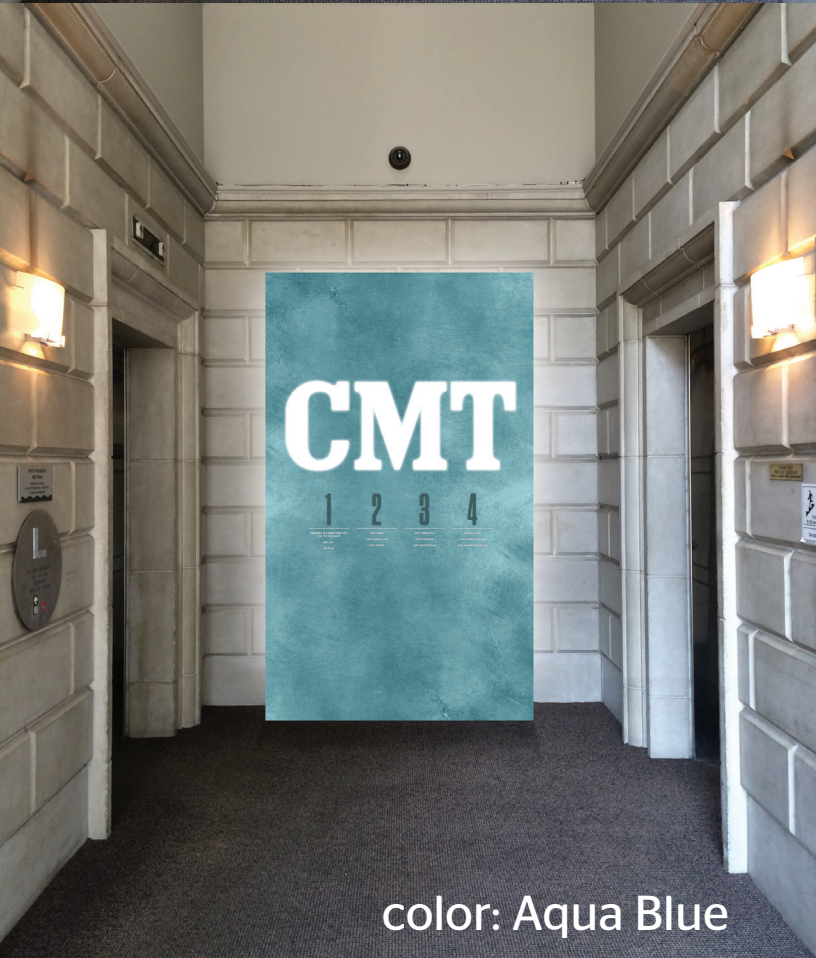
color: Aqua Blue